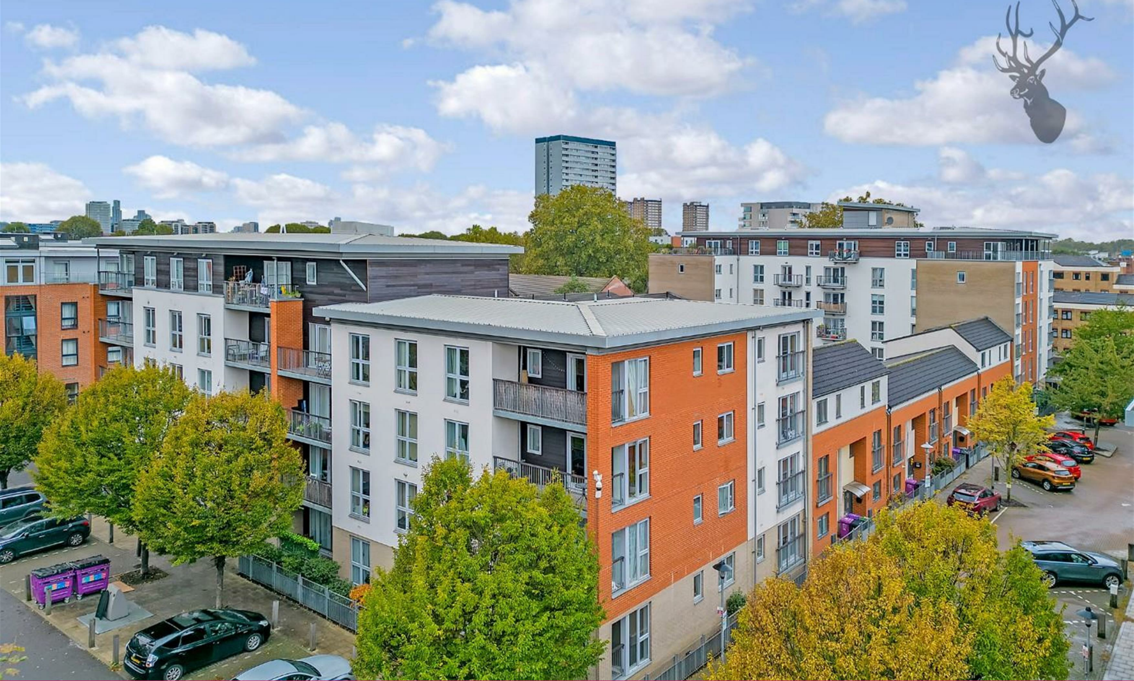
Matilda Gardens, London, E3